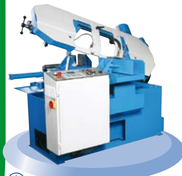
Comfort 260 A Automatic Bandsawing Machine fully hydraulic cutting cycle, on request with NC control