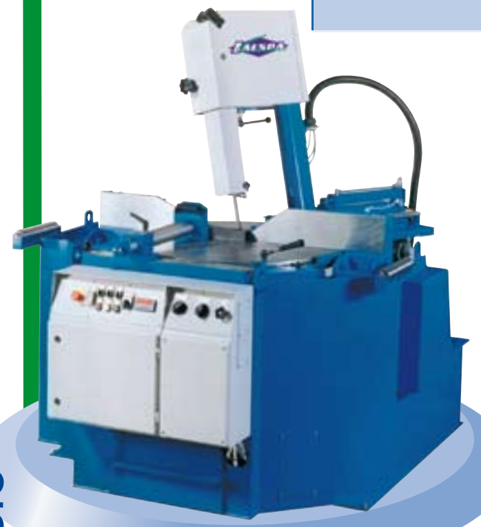
Classic 302 DGH semi-automatic Vertical Shifter Bandsaw for mitre cuts to 4 sides, hydraulic sawfeed, manual material clamping, angles up to \pm 45^\circ , -30^\circ ( 60^\circ ), turntable additionally \pm 45^\circ