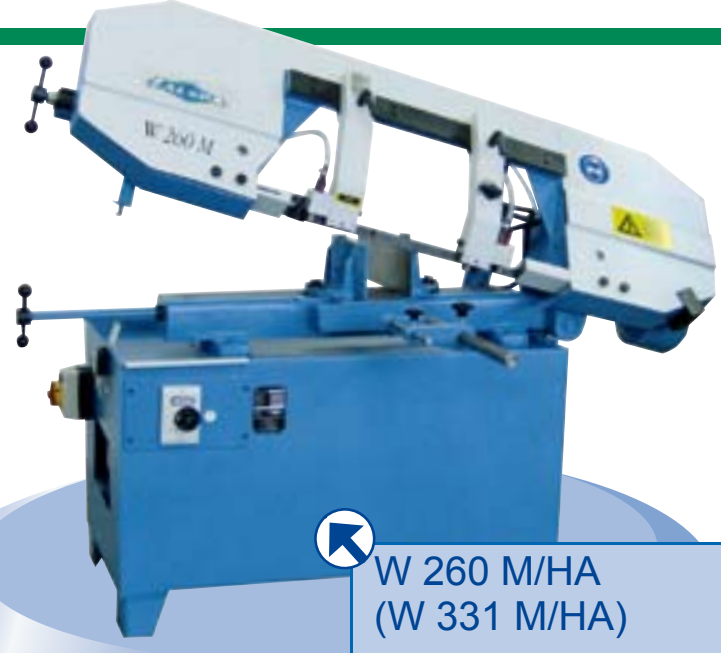
W 260 M/HA (W 331 M/HA) Sturdy bandsawing machine Capacity \circ 260 mm (330 mm) \square 410 x 200 mm (590 x 250 mm)