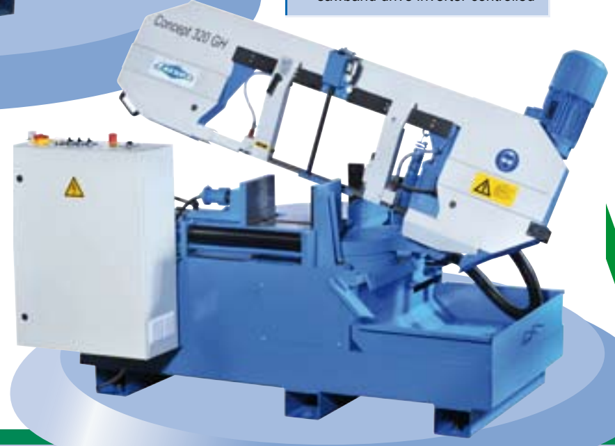
Concept 320 GH semi-automatic bandsaw for mitre cuts to one side hydraulic sawfeed, sawbow lift and material clamping, angles up to 30^\circ ( 60^\circ )