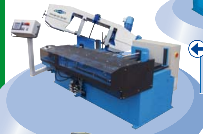
Concept 321 GA-NC Automatic Mitre Cutting Bandsaw with NC control, fully hydraulic cutting cycle, angle cutting up to 30^\circ to one side