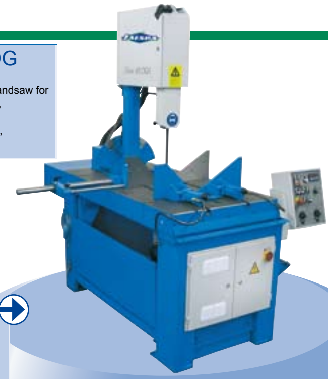
Classic 423 DGH semi-automatic Vertical Mitre Bandsaw, hydraulic material clamping and sawfeed, mitre cuts up to \pm 30^\circ ( 60^\circ )