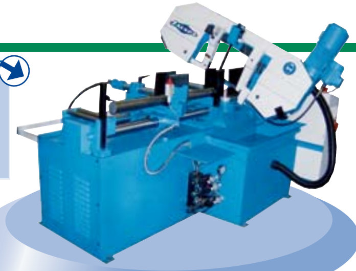
Concept 241 GA Automatic Mitre Cutting Bandsaw fully hydraulic cutting cycle, angle cutting up to 30^\circ to one side on request with NC control