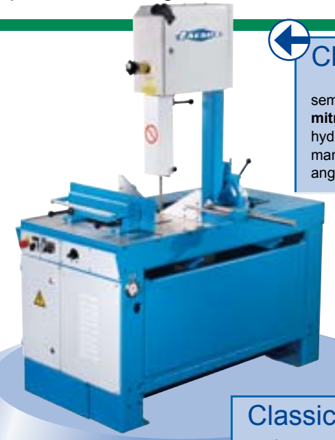
Classic 300 DG semi-automatic vertical bandsaw for mitre cuts to both sides, hydraulic sawfeed, manual material clamping, angles up to \pm 30^\circ ( 60^\circ )