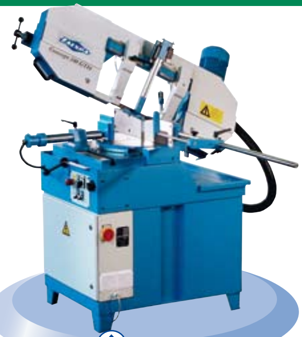
Concept 240 GT/H Concept 260 GT/H for mitre cuts to both sides, with turntable, hydraulic sawfeed, angle cutting to \pm 45^\circ and -30^\circ ( 60^\circ ) Execution H: Material clamping hydraulically, semi-automatic cutting cycle