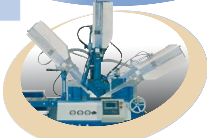
Classic 520 DGH semi-automatic Vertical Bandsaw for mitre cuts to both sides, hydraulic sawfeed and material clamping, for angles \pm 45^\circ , -30^\circ ( 60^\circ )